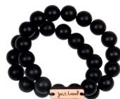
The KUUL bracelet - twice