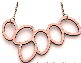
The LASER necklace, 6 L.