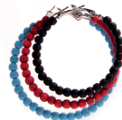
The KUL loop, S/M/L