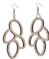
The LASER earrings - supersize