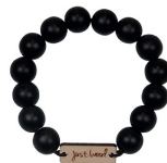
The KUUL bracelet