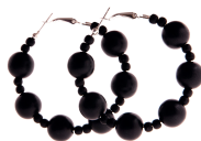
The KUL loop, combo