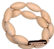
The BASIC no.2 bracelet