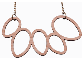
The LASER necklace, 5 L.