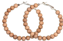
The KUL loop, M beads, natural