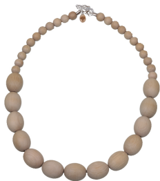
The BASIC no.1 necklace