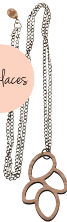
The LASER necklace - long.