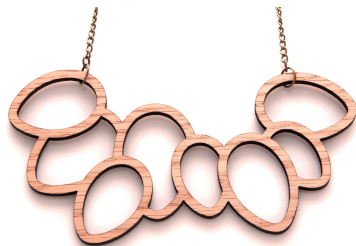
The LASER necklace, 8 L.