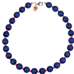
The KUL child necklace