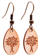
The WOOD earrings