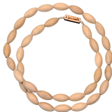
The BASIC no.2 necklace