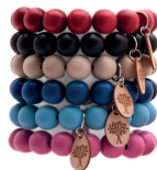
The KUL colors