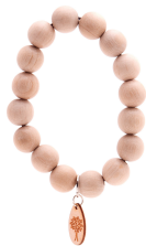
The KUL bracelet, natural